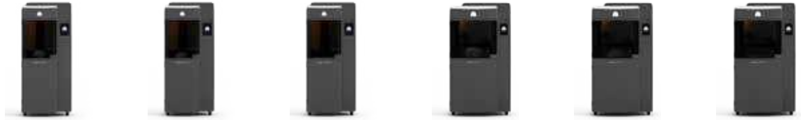
ProJet 6000 SD ProJet 6000 HD ProJet 6000 MP ProJet 7000 SD ProJet 7000 HD ProJet 7000 MP

Extend Innovation. Extend Production. Extend Choices.