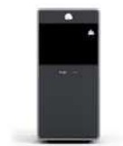
ProJet® 3510 MP