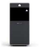
ProJet® 3510 DP